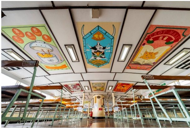
Image 6: The City Odyssey series merges traditional wooden relief craftsmanship with modern laser-cutting technology. Displayed on the “Twinkling Star” Ferry’s glass frames, the hand-painted reliefs depict Hong Kong’s iconic streetscapes and festivities, showing tourists the vibrant local culture.

Image 5: Play with Slang , a series of posters illustrating Hong Kong slang expressions, are displayed on the ceiling of the “Twinkling Star” Ferry until 5 June. Each design creatively pairs Cantonese slang terms with English translation and transliteration, offering tourists a playful gateway into the local language.